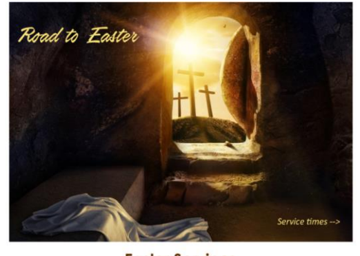
Easter Services Friday 7 April 9:30am - Good Friday Sunday 9 April 9:30am - Easter Sunday