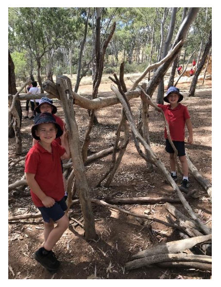
Can you spot the Kangaroo in the background?