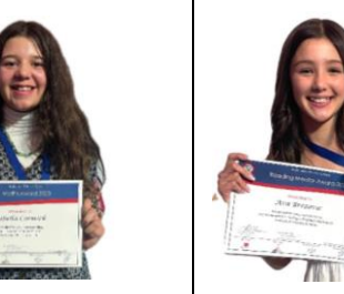
A 'Sports Award' and a 'Maths Award'

As reading mentors they regularly helped younger students to develop their literacy skills.